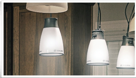
Power Your Emergency