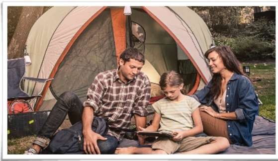
Power Your Camp