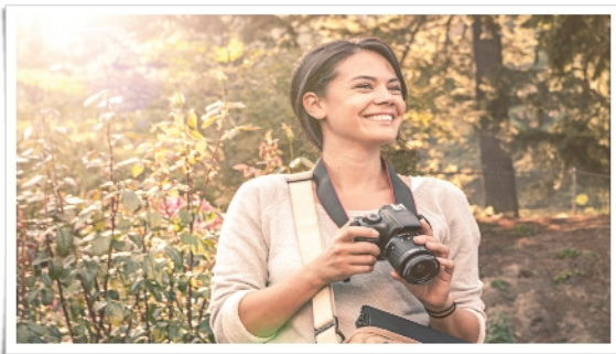
Power Your Life